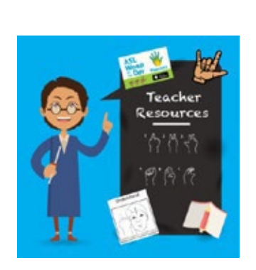
More Lesson Worksheets <u>here</u>.