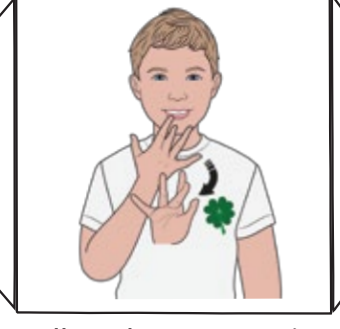
Collect the entire series.